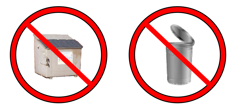
Figure 2 Stiff penalties exist for improper disposal of leadacid batteries

Batteries are regulated at the local, state, federal, and international levels, and a myriad of compliance legislation exists that must be adhered to. Fortunately, data center professionals don't need to concern themselves with the risk, cost, and complexity of the battery disposal issue if they involve legitimate partners when retiring spent batteries.