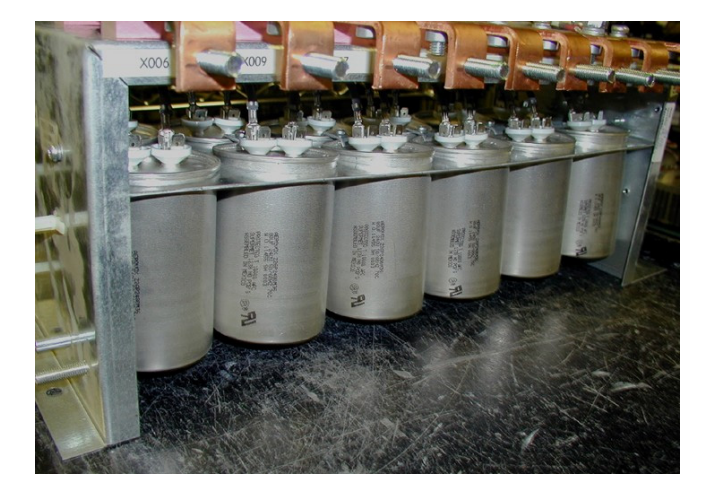
Figure 1 UPS output AC capacitor bank

temperature and current stress for UPS designs have the potential to affect power capacitor lifetimes substantially as well, but their effects are less than when voltage stress is varied. Figure 1 below shows a typical AC capacitor bank, also known as a capacitor rack.